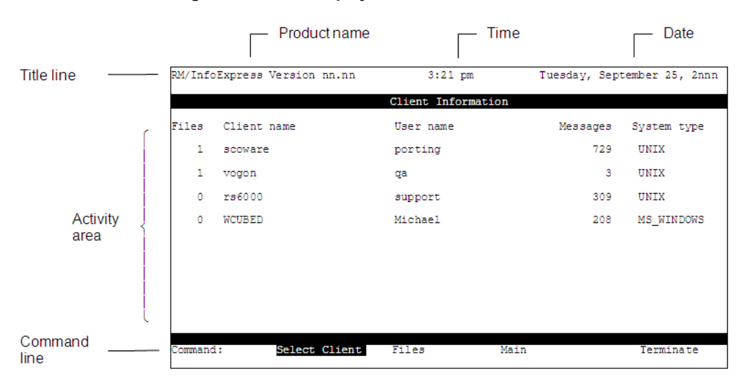
Figure 2: Server Display Screen Format

Except for the main screen (illustrated on the following page), each RM/InfoExpress Server Display program screen has the same basic format, as illustrated in Figure 2.