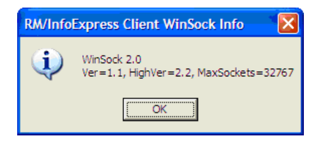
Figure 1: RM/InfoExpress Client WinSock Info Message Box

If no message box appears, the RM/InfoExpress Windows client software is not properly installed or started. Check that the RM/InfoExpress Windows client DLL file ( rmtcp32.dll ) exists in your application installation directory.